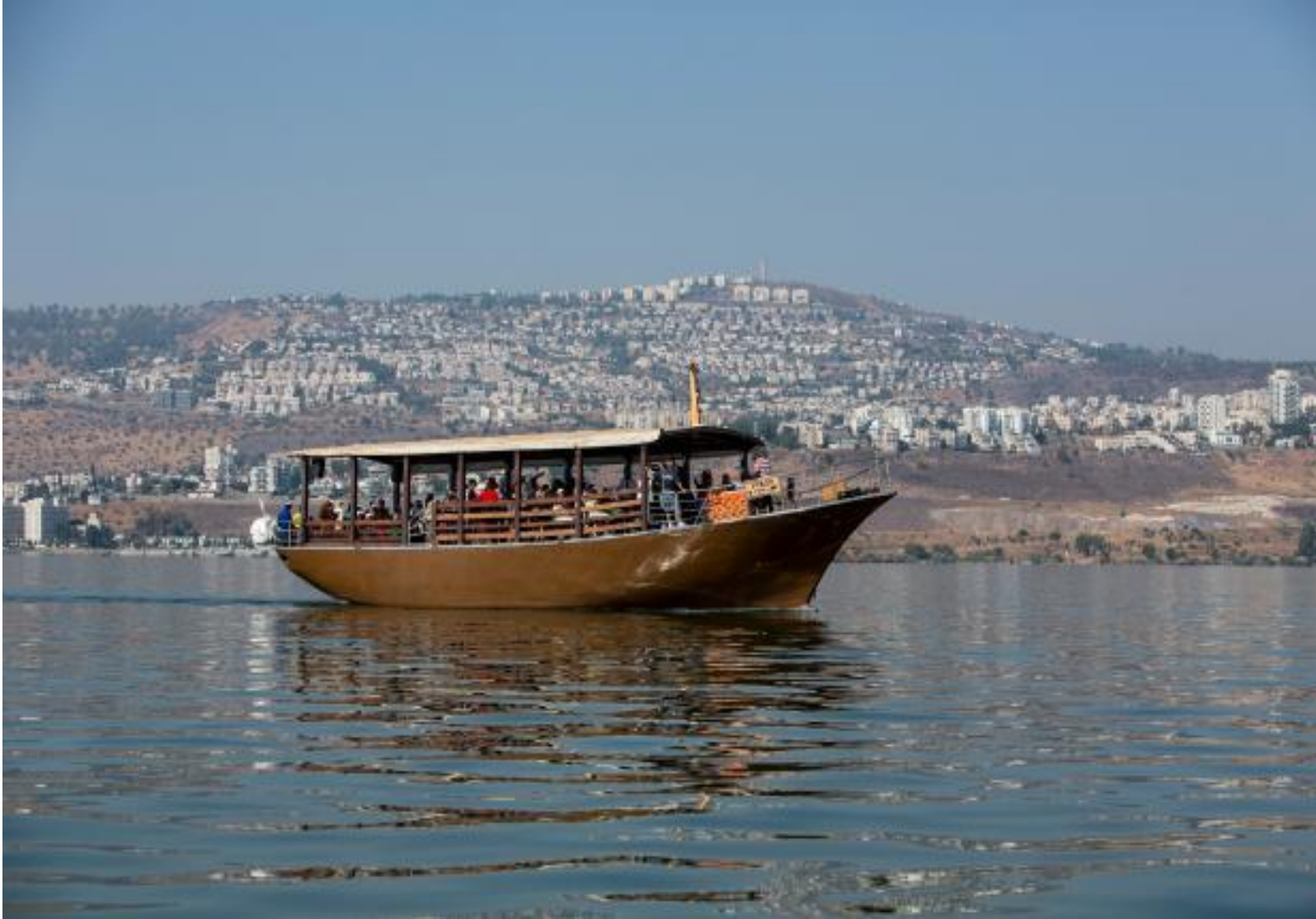
Sea of Galilee. It's here that the Bible says Yahshua preached and walked on water.