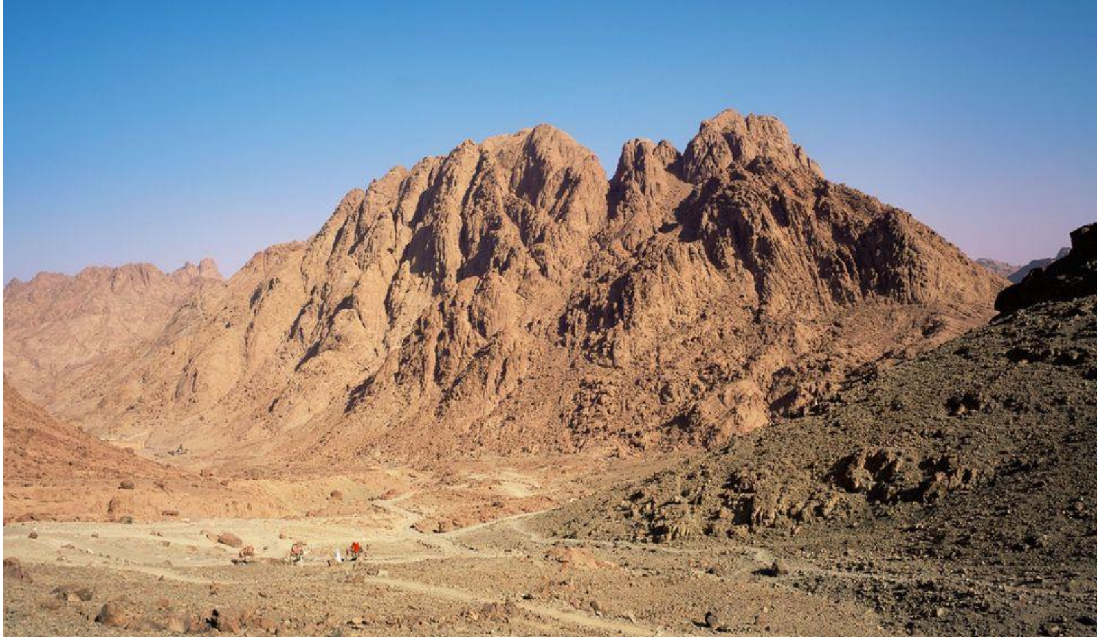
Mount Sinai, also known as Jabal Musa, the place where according to the Torah, Bible and Quran, Moses received the Ten Commandment." And the LORD said unto Moses, Come up to me into the mount, and be there: and I will give thee tables of stone, and a law, and commandments which I have written; that thou mayest teach them. " (Exodus 24:12).