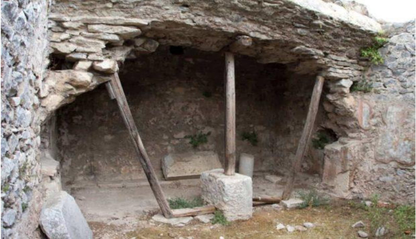
Jail, Philippi. A possible site of philippian jail where Paul and Silas led the jailor to Messiah, "...And brought them out, and said, Sirs, what must I do to be saved? And they said, Believe on the Yahshua Messiah..." (Acts 16: 23-40)

TISHRI-ETHANIM 1 Kings 8:2 SEVENTH MONTH תשרי