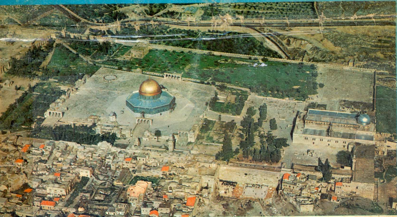
Looking East, showing Mohammedan Jerusalem. The Old City from the air. From here He commanded blessings, even life forevermore. He hath chosen ZION. He hath desired it for His habitation. "Here will I dwell". — Psalms 132: 13, 14, and 133: 3. Mosque where Solomon's Temple stood. Note Eastern Wall, on the side of the Valley of Jehoshaphat.